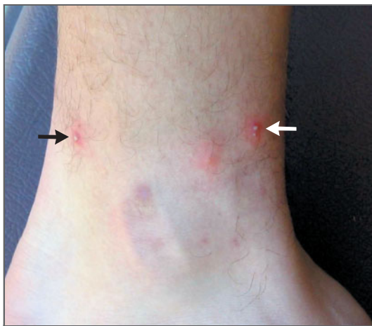
Figure 2. Stings from a Fire Ant on an Ankle, Showing the Pseudopustule.

The clustering of the stings (white arrow) contrasts with the single sting (black arrow) in the photograph, which was taken 24 hours after the event. This pattern is typical of fire-ant stings, as one ant will often inflict multiple stings in a semicircular arc if given time to do so. Also, the pseudopustule is typical of fire-ant stings; it is not a pustule. The stings occurred just above the level of the ankle sock the patient was wearing on the day of the event.